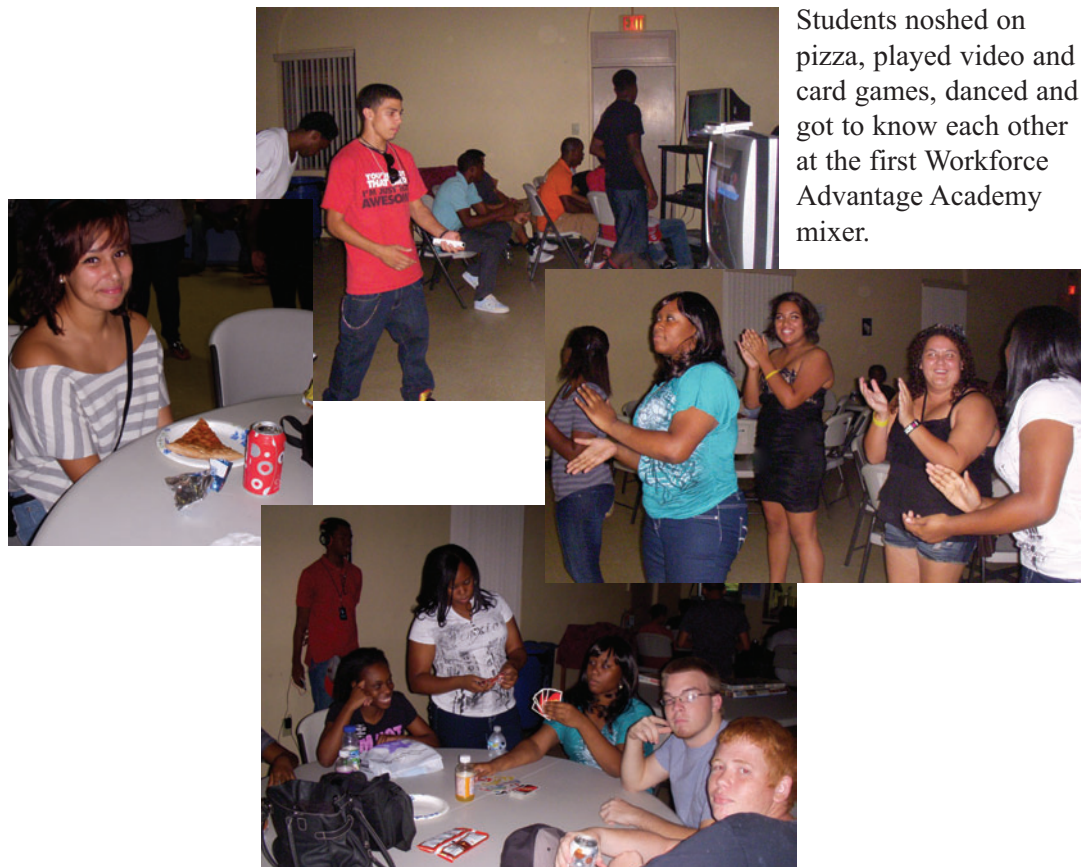
Students noshed on pizza, played video and card games, danced and got to know each other at the first Workforce Advantage Academy mixer.